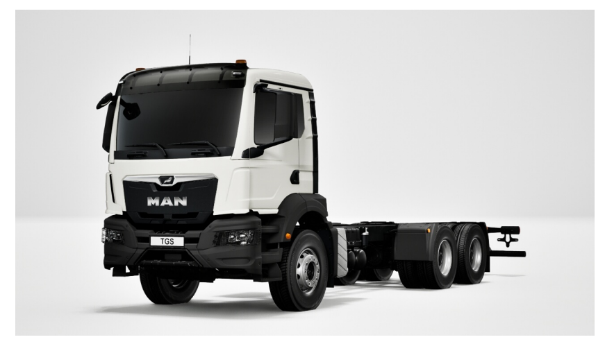
Illustration can deviate