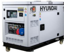
Non contractual picture