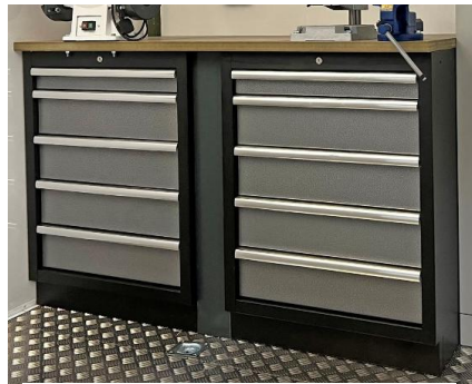
Non contractual picture

1 cabinet with lockable door, approximate dimensions 1200 x 400 x 500 mm