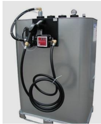
Non contractual picture