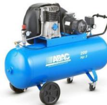
Non contractual picture