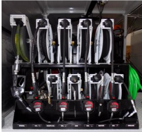
Non contractual picture