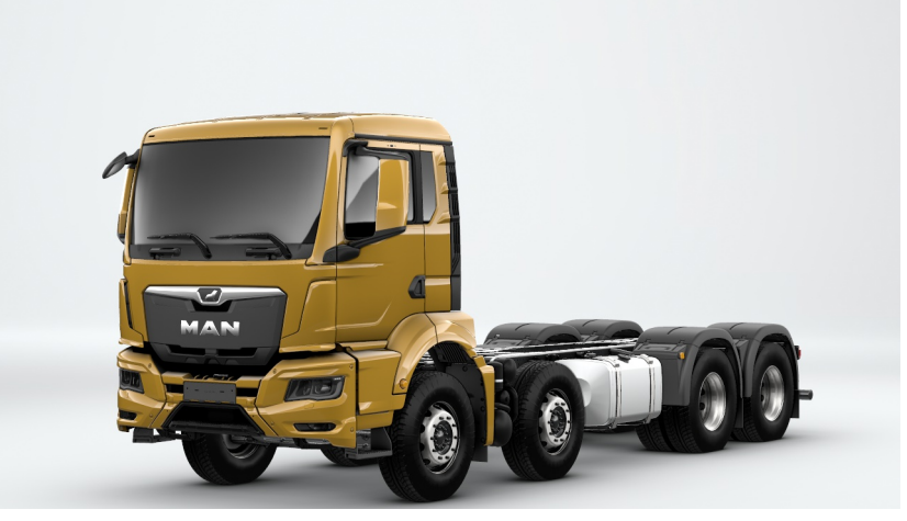
Illustration can deviate