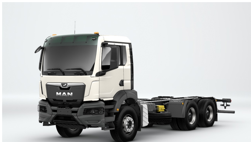
Illustration can deviate