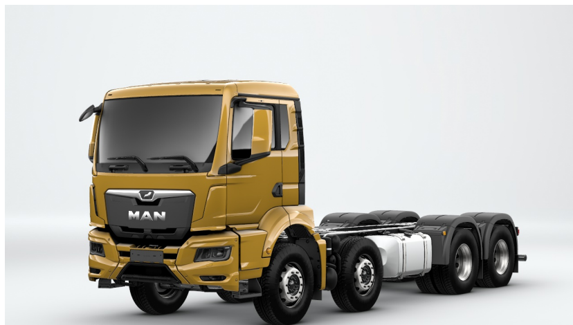
Illustration can deviate