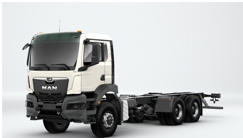
Illustration can deviate