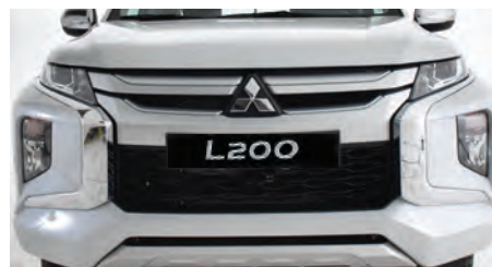
Radiator grill - Chrome NEW