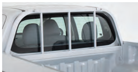
Rear body guard

Note: Some of the equipment may vary in appearance or availability. Please check with your nearest Al Habtoor Motors, Mitsubishi Showroom.