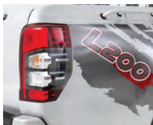
Rear combination lamps NEW