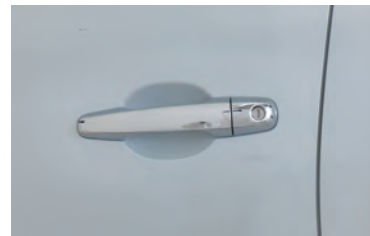
Chrome outer door handles