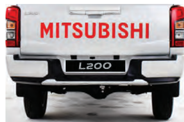
Rear bumper NEW